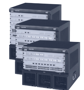
3Com Switch 7750 Family