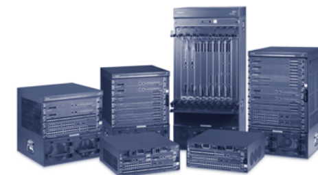
3Com Switch S7900E Family