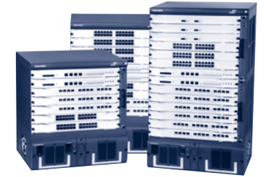
3Com Switch 8800 Family